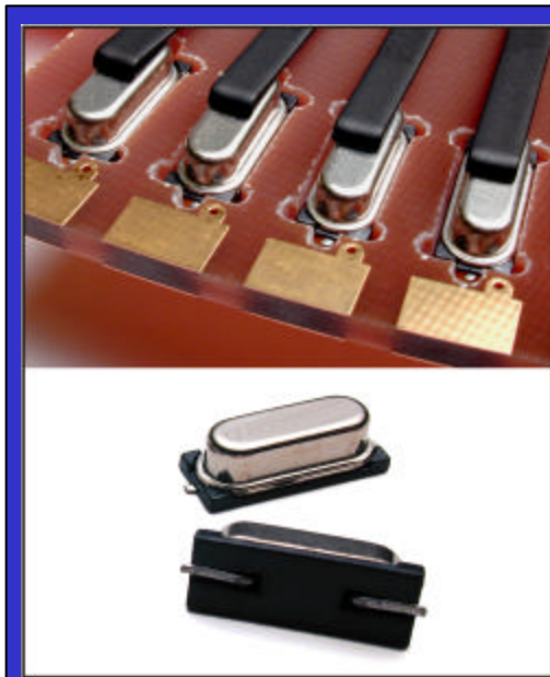
Chamber holds 2 or 4 disc pallets